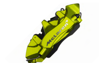
Flux Green with Silver Machined McLaren Logo