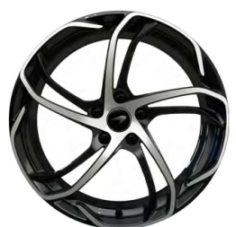
Gloss Black Diamond Cut