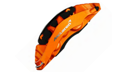
McLaren Orange with Silver Printed McLaren Logo