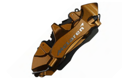
Bronze with Silver Machined McLaren Logo