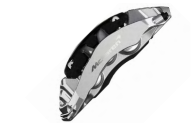
Liquid Silver with Silver Printed McLaren Logo