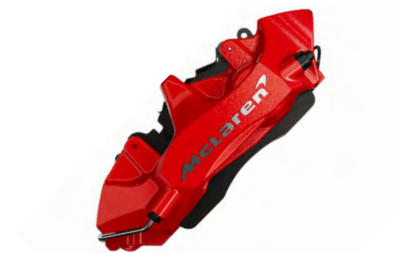
Red with Silver Machined McLaren Logo