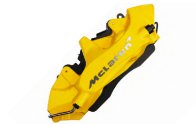
Yellow with Silver Machined McLaren Logo