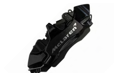
Black with Silver Machined McLaren Logo