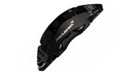
Black with Silver Printed McLaren Logo