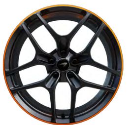
Stealth with McLaren Orange Border