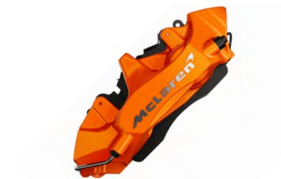
McLaren Orange with Machined McLaren logo