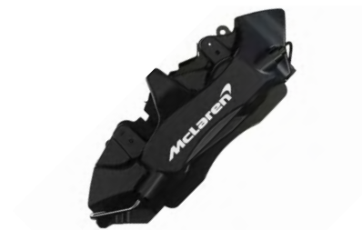
Anodised Black with White Printed McLaren Logo