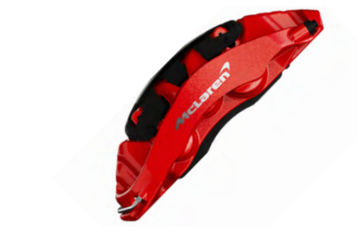
Red with Silver Printed McLaren Logo