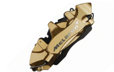
Speedline Gold with Silver Machined McLaren Logo