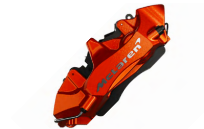
Azores with Silver Machined McLaren Logo