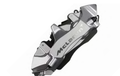
Polished with Silver Machined McLaren Logo