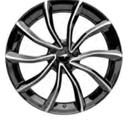
Gloss Black Diamond Cut