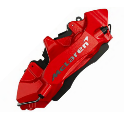
Red with Silver Machined McLaren Logo