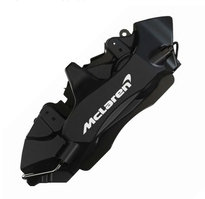
Black Anodised with White Printed McLaren Logo