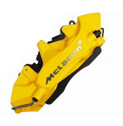
Yellow with Silver Machined McLaren Logo