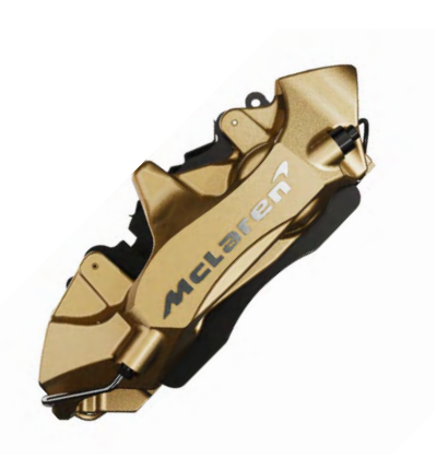
Speedline Gold with Silver Machined McLaren Logo