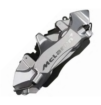
Polished with Silver Machined McLaren Logo