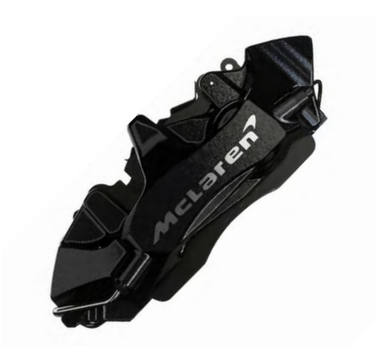
Black with Silver Machined McLaren Logo