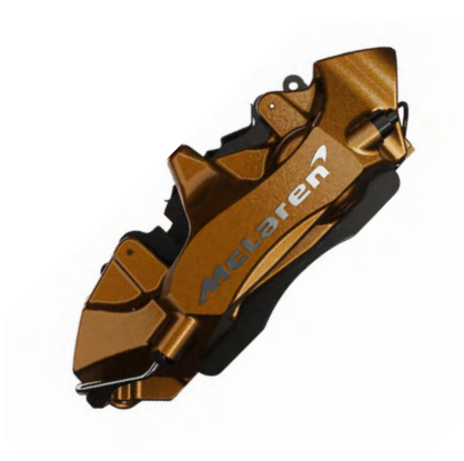
Bronze with Silver Machined McLaren Logo