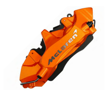
McLaren Orange with Silver Machined McLaren Logo