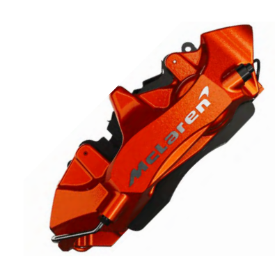
Azores with Silver Machined McLaren Logo