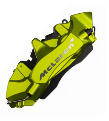
Flux Green with Silver Machined McLaren Logo