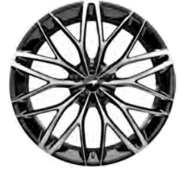
Gloss Black Diamond Cut