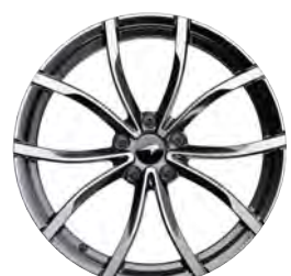
Stealth Diamond Cut