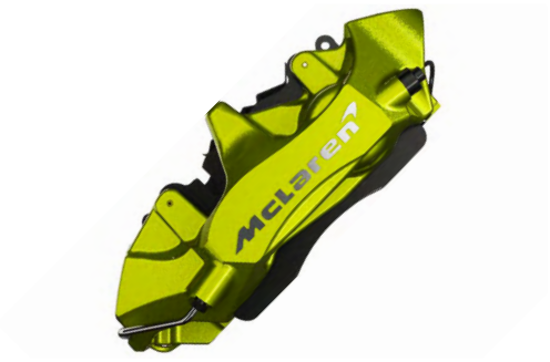
Flux Green with Machined McLaren logo