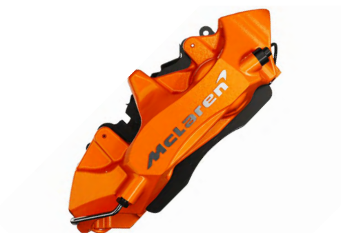
McLaren Orange with Machined McLaren logo