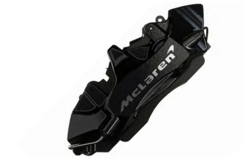
Black with Machined McLaren logo