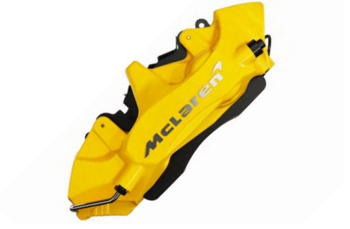
Yellow with Machined McLaren logo