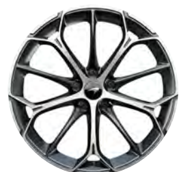
Stealth Diamond Cut