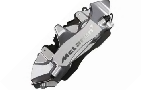
Polished with Machined McLaren logo