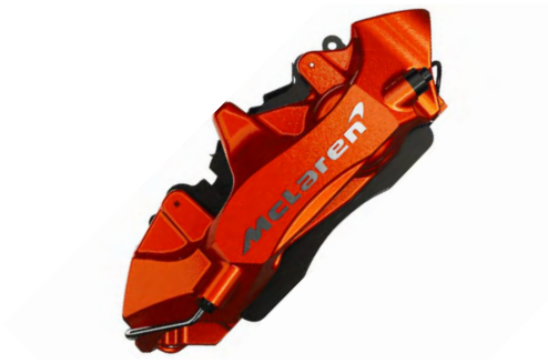
Azores with Machined McLaren logo