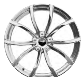
Titanium Liquid Metal