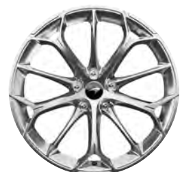
Titanium Liquid Metal