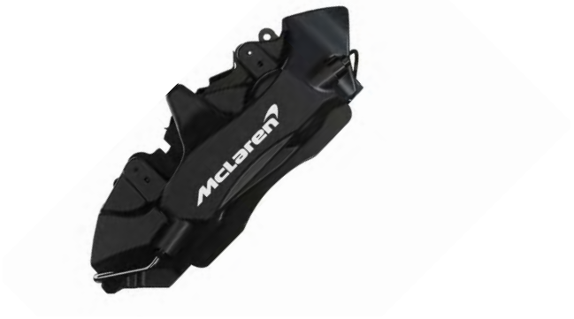
Black Anodised with White Printed McLaren Logo