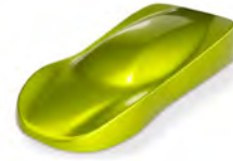
Flux Green II