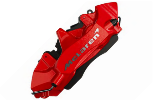
Red with Machined McLaren logo