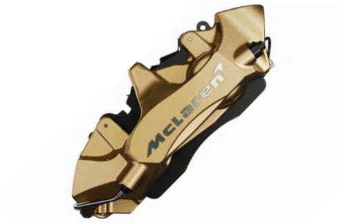
Speedline Gold with Machined McLaren logo