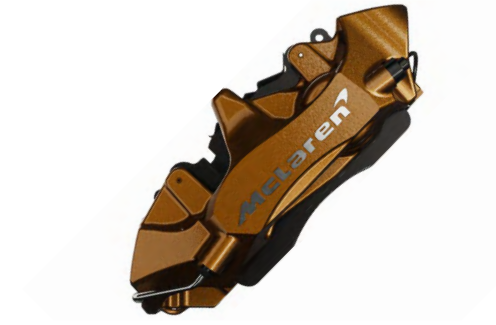
Bronze with Machined McLaren logo